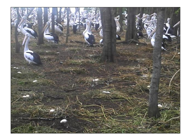
Figure 2 . Snake Island colony on 8 August 2011.

the north-west section of Snake Island, had nests with eggs in August (Figure 2), and chicks of varying age in November.