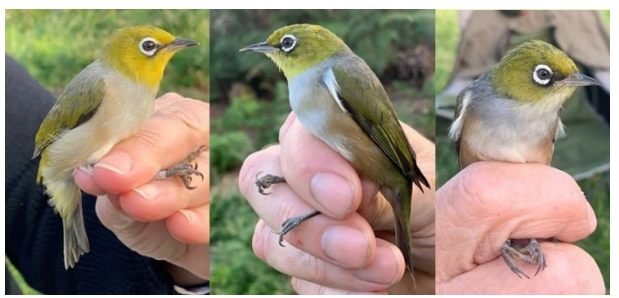
Figure 2 . The three Silvereye subspecies on Broughton Island: (Left) cornwalli (yellow throat, pale-buff flanks) (Middle) westernensis (grey-yellow throat, buff flanks) (Right) lateralis (grey throat, deep buff flanks).

The Silvereye is now the most common species on Broughton Island. Around 550 individual birds have been banded on the island since 2017, with many retraps (Little et al. 2020; Stuart 2020; G. Little pers. comm.). There is a resident or regularly visiting population of subspecies cornwalli which swells because of an autumn/winter influx of migratory westernensis and lateralis subspecies birds and then a spring influx of locally nomadic cornwalli birds (Little et al. 2020; Stuart 2020). Images taken on Broughton Island of the three Silvereye subspecies are presented in Figure 2 .